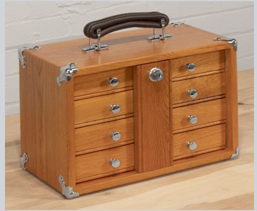
GI-T12: Weight: 8 LBS - Overall Dimensions 11 7/8" W x 5 3/4" D x 8 1/8" H