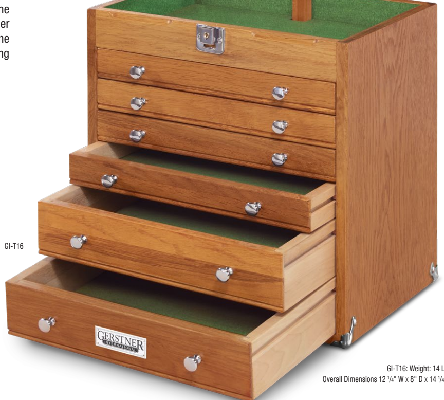
GI-T16: Weight: 14 LBS Overall Dimensions 12 1/4" W x 8" D x 14 1/4" H