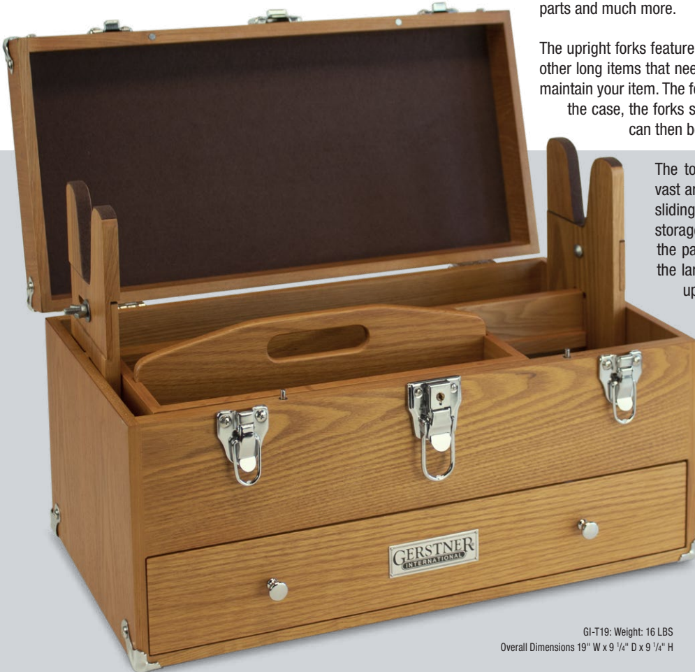
GI-T19: Weight: 16 LBS Overall Dimensions 19" W x 9 1/4" D x 9 1/4" H

Great for artist supplies, tools, fly fishing parts and much more.