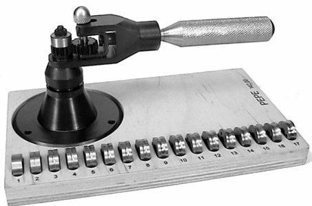
Standard Model No.142.00

This tool is not designed for use on wedding bands.